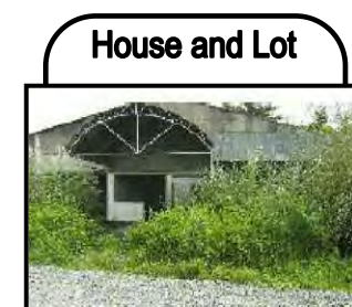
House and Lot

Title ID : 20252 Lot Area: 950.00 sqm. Floor Area: 142.00 sqm. TCT # T-51767 Lot 2301-B Poblacion, Rosales, Pangasinan Market Price: 802,600.00 Min. Bid Price : 650,000.00