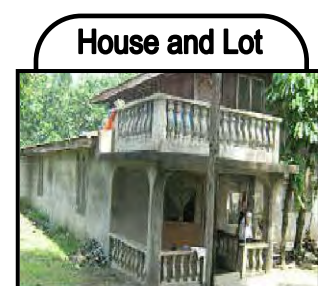
House and Lot

ITEM PB80 - Vacant Lot Title ID : 11659 Lot Area: 100.00 sqm. TCT # T-238984 Blk. 16 Lot 5 Canarvacanan Binalonan Pangasinan Market Price: 70,000.00 Min. Bid Price : 56,000.00