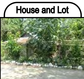
House and Lot

ITEM PB78 - Vacant Lot Title ID : 11728 Lot Area: 99.00 sqm. TCT # T-238980 Blk. 16 Lot 1 Canarvacanan Binalonan Pangasinan Market Price: 99,000.00 Min. Bid Price : 80,000.00